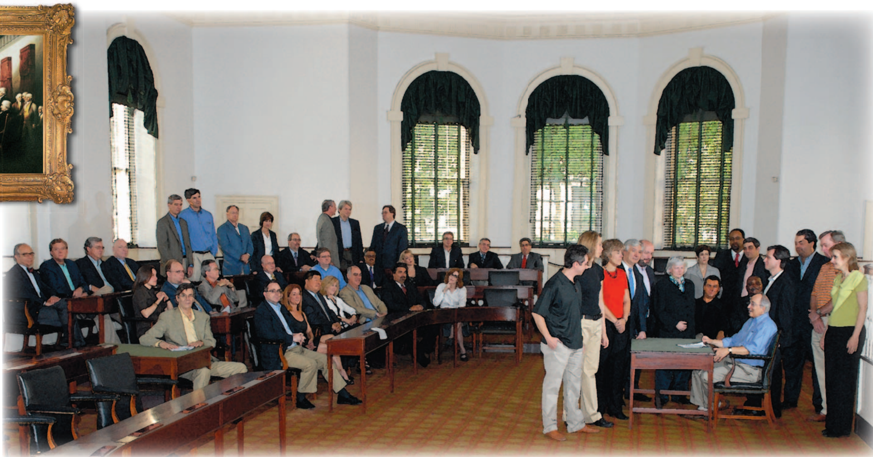
PHOTO BY CURT HUDSON, PHOTO ILLUSTRATION BY JOHN SPENCER | BUSINESS JOURNAL